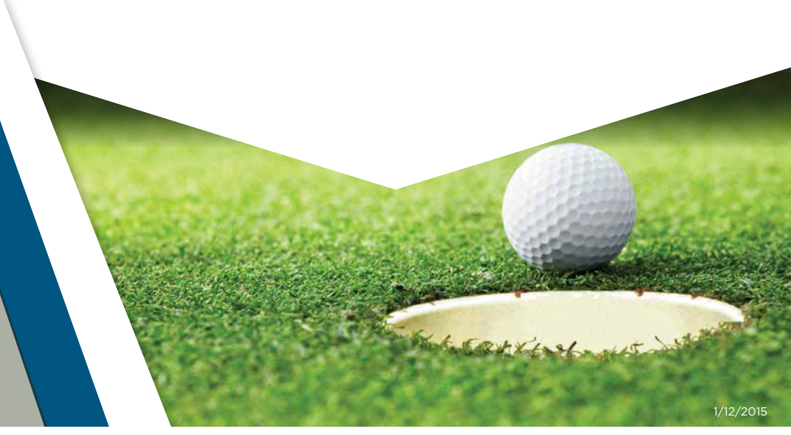
It is the policy of SporTurf™ to continuously improve it line of products. Therefore, SporTurf™ reserves the right to change, modify or discontinue systems, specifications and accessories of all products at any time without notice or obligation to purchaser.